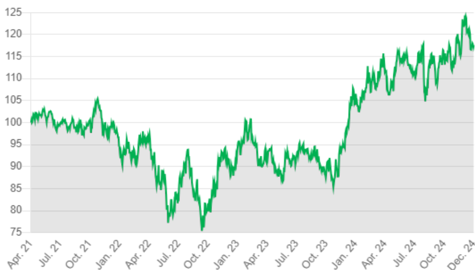
Monthly performance of the certificate net of fees (%):